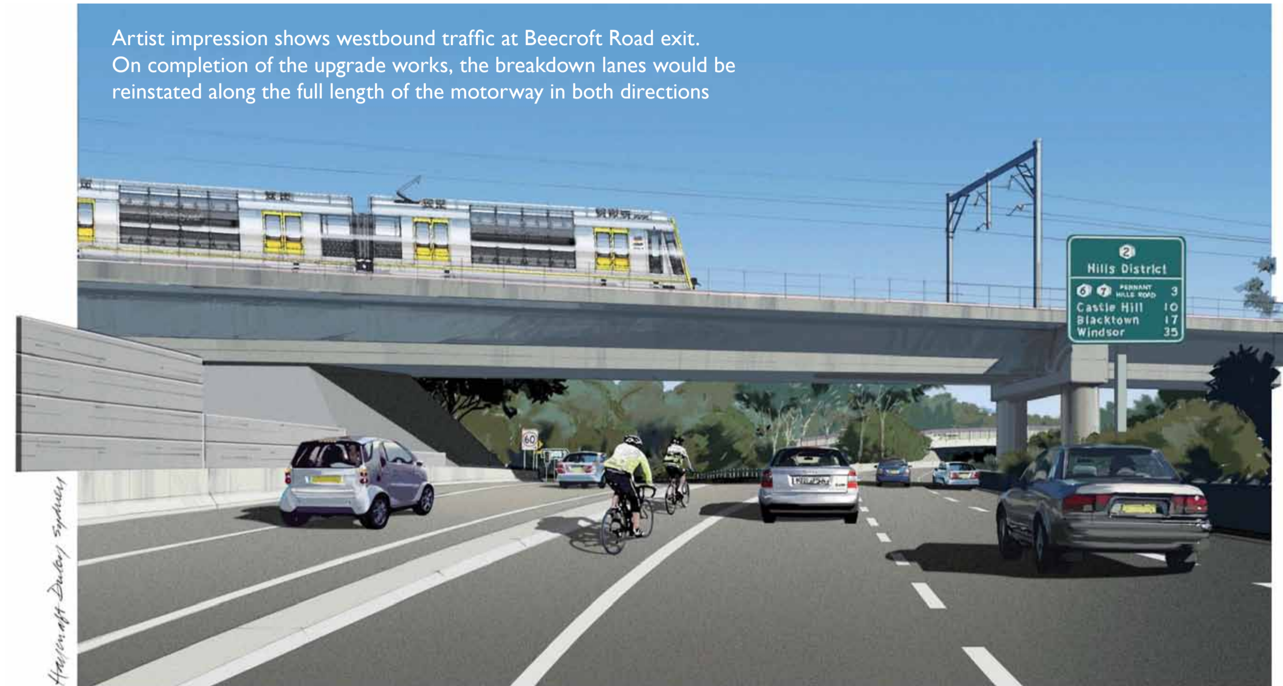
Artist impression shows westbound traffic at Beecroft Road exit. On completion of the upgrade works, the breakdown lanes would be reinstated along the full length of the motorway in both directions

On completion of the Upgrade the shared breakdown lanes would be reinstated for cyclists along the full length of the motorway in both directions from Delhi Road to Abbott Road, including through the Norfolk Tunnel.